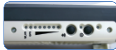
Front view, close-up