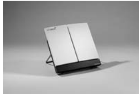
Thrane & Thrane EXPLORER 500