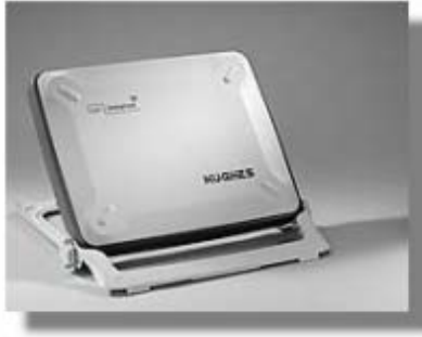
Hughes HNS 9201