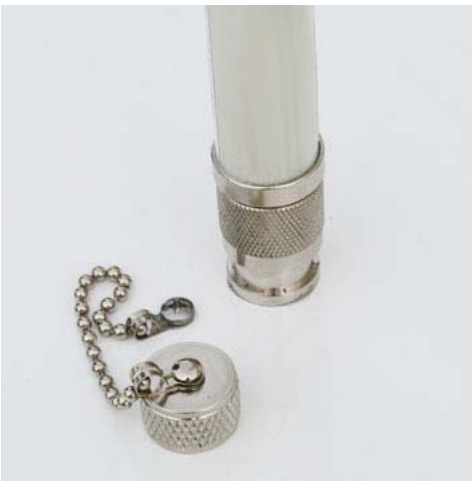
There are two high gain, range extending antennas that are both removable for added security when stored. The exposed connectors are protected by a weather proof metal twist cap.