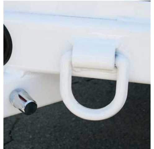
Four helicopter D-Rings let the T-100 to be moved anywhere. The weight of the trailer fully loaded with all equipment is under 1400 lbs.