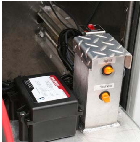
An onboard battery powers cabinet lights and the trailer's emergency flashers when the generator is not running. Helpful for dark nights.