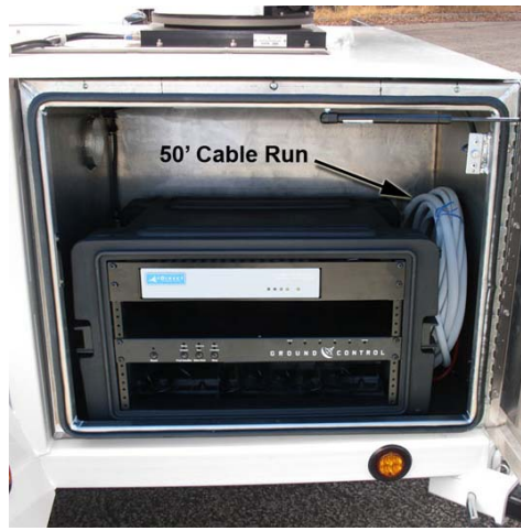
A 6RU rackmount case is locked behind a stainless steel weather-proofed trailer cabinet door. The rack-mount itself can be moved up to 50 feet from the trailer, and placed inside of a structure or tent if desired.