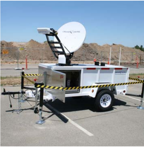
The T-100 is fully self-contained and easy to operate. One-Button deployment and a half-mile radius 802.11 wireless connectivity requires no special certification or licensing to use.