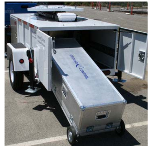
The T-100 can also be configured so the Toughsat dish on top of the trailer is boxed into our Flyaway Case for easy shipping of the satellite system anywhere.