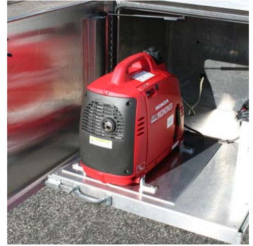
The 1000W Honda ultra-quiet generator is more than capable of handling the 90 Watts the system pulls at maximum power. It can run for more than 8 hours on a single tank (one gallon) of gas.