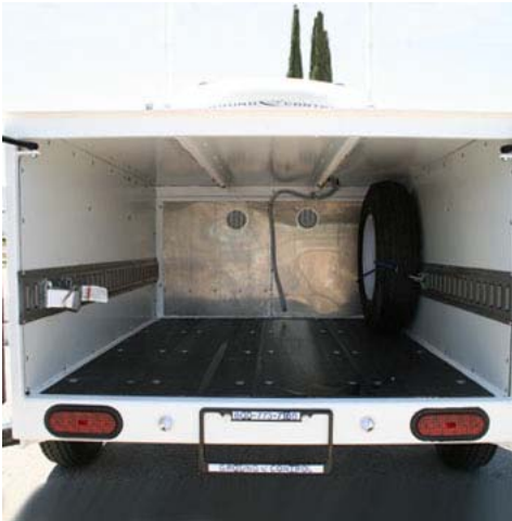
The weather resistant enclosed rear lockable storage bay includes a spare tire. Interior dimensions are 62"L x 46"W x 24"H.