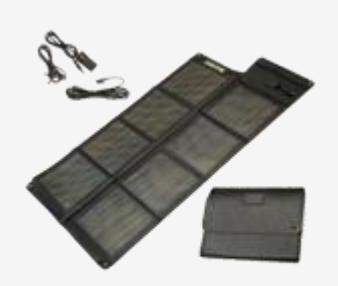
Click for larger image