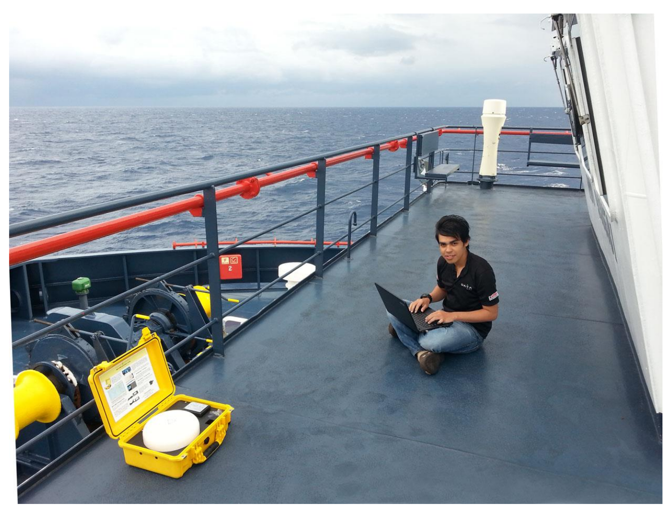
The MCD-4800 may be used on a moving vessel, even during heavy seas.

Power - On/Off – When pressed, the power button will light up when the terminal is turned on. To power the system off, simple press the button again.