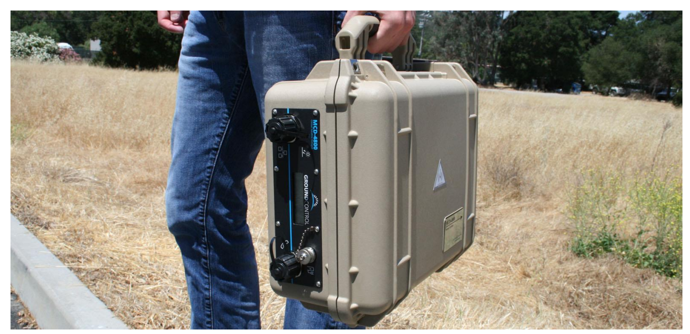
The MCD-4800 is watertight, and operates with the case lid closed.