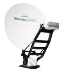
Toughsat Vehicle Mount

Ground Control offers several equipment solutions for phone service over our satellite network. We manufacture the Toughsat mobile dishes for trucks, trailers and vehicles, as well as a ground mounted system, and a self-contained trailer. You may also use a standard fixed dish for service.