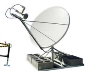
Fixed Satellite Dish