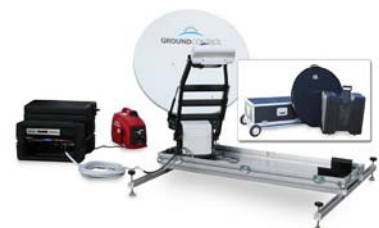
Toughsat Flyaway Case