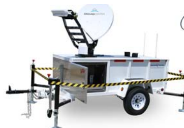
Toughsat T-100 Trailer