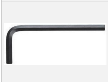
9/64" Hex Wrench