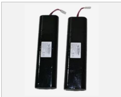
Gen 2 – MCD-4800 Battery Packs