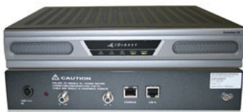
iDirect Satellite Router

The Toughsat TS2 Antenna Control Unit has simple front panel controls. Deploy, Stow, Stop and Power. The iDirect Evolution X5 gateway powers Ground Control's performance satellite network.