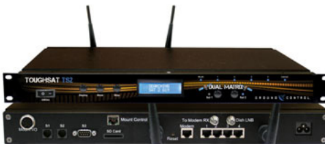
TOUGHSAT TS2 Controller

Toughsat XP's are very popular with public safety organizations because they are easy to use and provide a stable and reliable connection no matter the location. The Toughsat has been designed to operate in extreme weather, temperatures and high-winds.