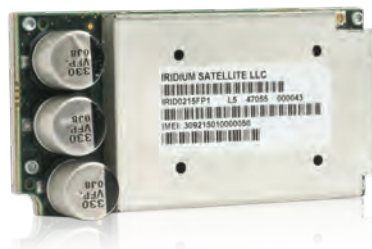
Iridium Core 9523 voice and data communications

Deployed in mission critical applications today, Iridium devices are thoroughly field-tested under some of the harshest environments known to man – from the frozen Arctic to equatorial deserts, and from high-altitude aircraft to robotic scientific gliders that submerge deep beneath the sea.