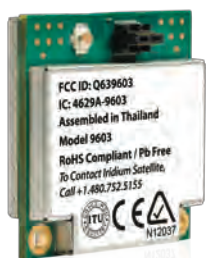
Iridium 9603 SDB data modem

With the smallest form factor of any commercial satellite transceiver available today, the Iridium 9603 is ideal for space constrained applications including monitoring, tracking and alarm systems. The Iridium 9603 combines the global coverage of the Iridium satellite constellation with the low latency of the Iridium SDB service to provide highly reliable communications from pole to pole. At one-fourth the cost and half the footprint of its predecessor, the Iridium 9602, the Iridium 9603 redefines the spatial possibilities of communication devices, delivering significant data capabilities and good value.